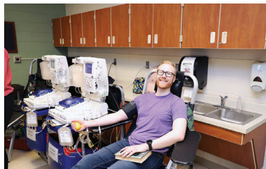
2-5. Nonprofit organizations with potential volunteers. Plus, the Blood Drive.